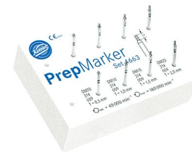
PrepMarker Set 4663